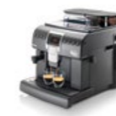
Royal Gran Crema

*Supplied separately; installed by the operator