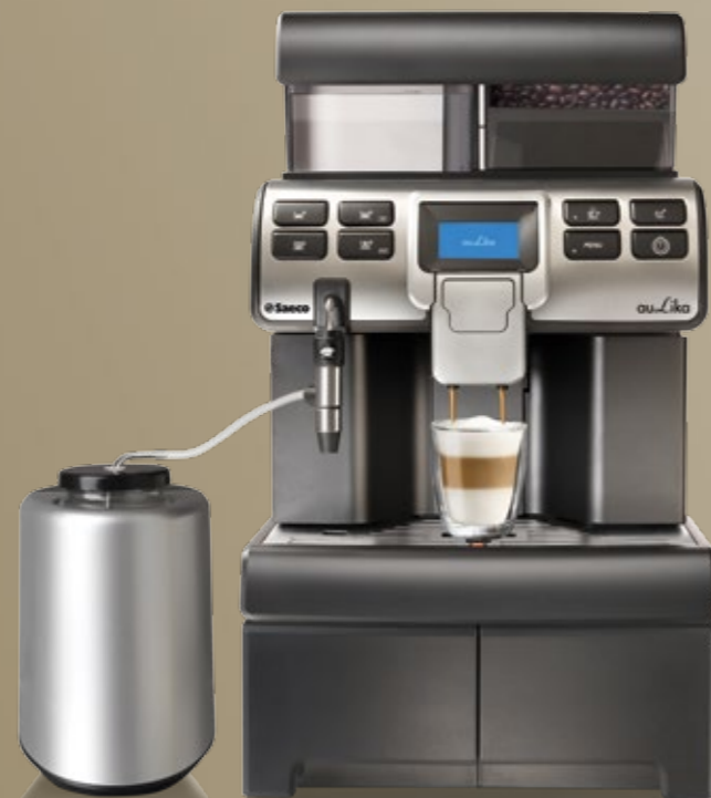
Aulika Mid Base

Painted metal and ABS matt black base, in family feeling with Aulika Mid, with 2 drawers for sugar bags, stirrers etc. Its use with the machine is suggested if the Astra refrigerator or Milk Cooler are present.