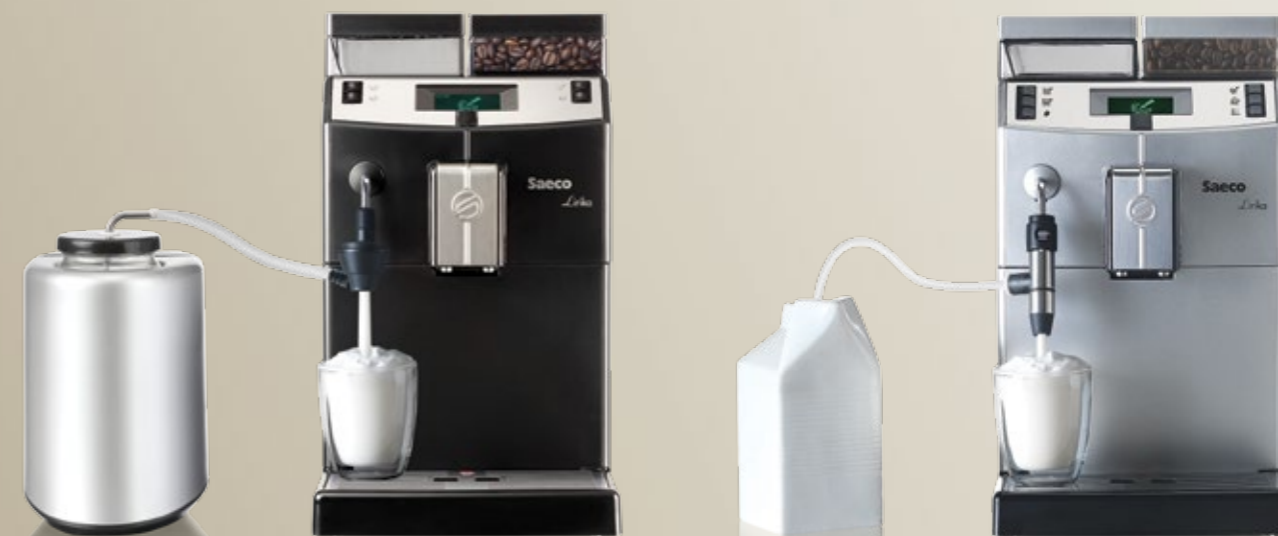
Lirika Tuono and Siluro Cappuccinatore

Tuono cappuccinatore and Siluro cappuccinatore (stainless steel), to be mounted on the steam wand for the frothing of creamy cappuccinos and milk drinks. It can be used also in combination with the Milk Cooler.