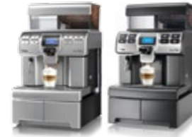
Aulika Top / Top RI