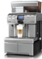
Aulika Top / Top RI High Speed Cappuccino